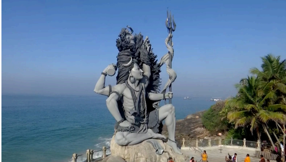
Aazhimala Shiva Temple

Transfer to Cochin airport according to flight departure time.