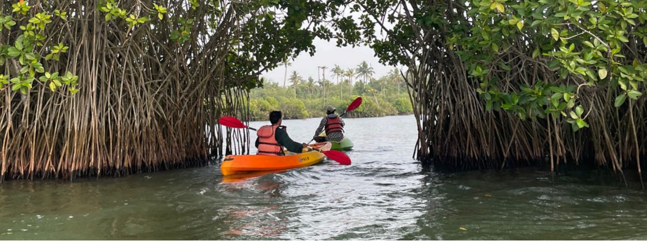
Kayaking in the mangrove