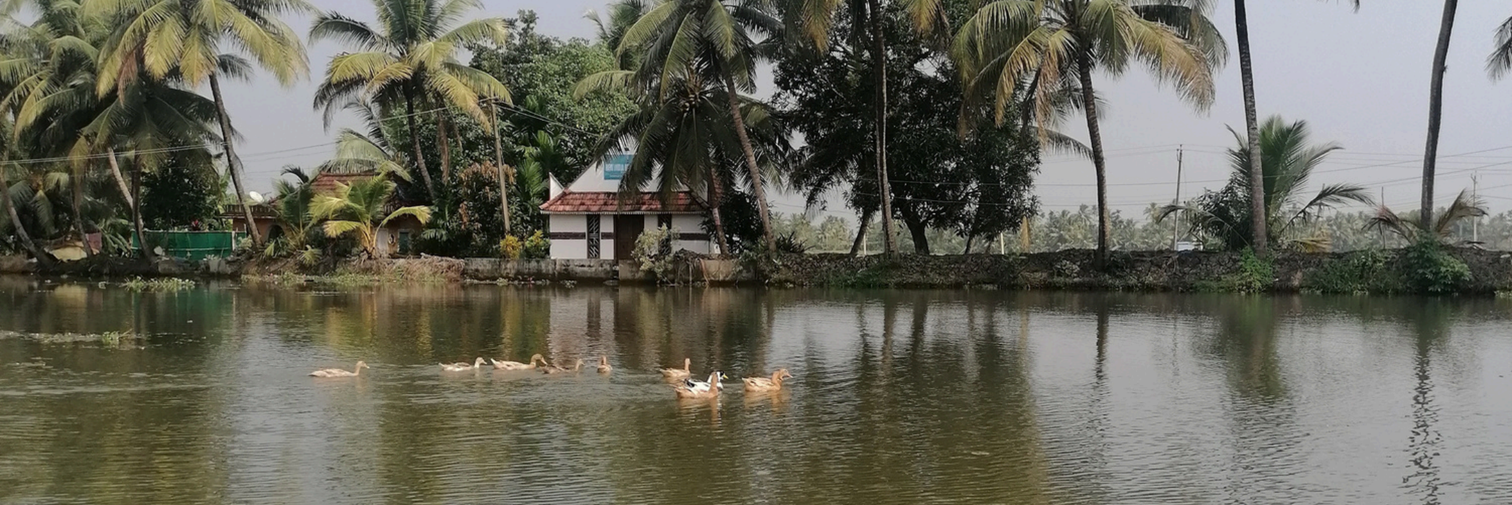
Backwaters in Kumarakom