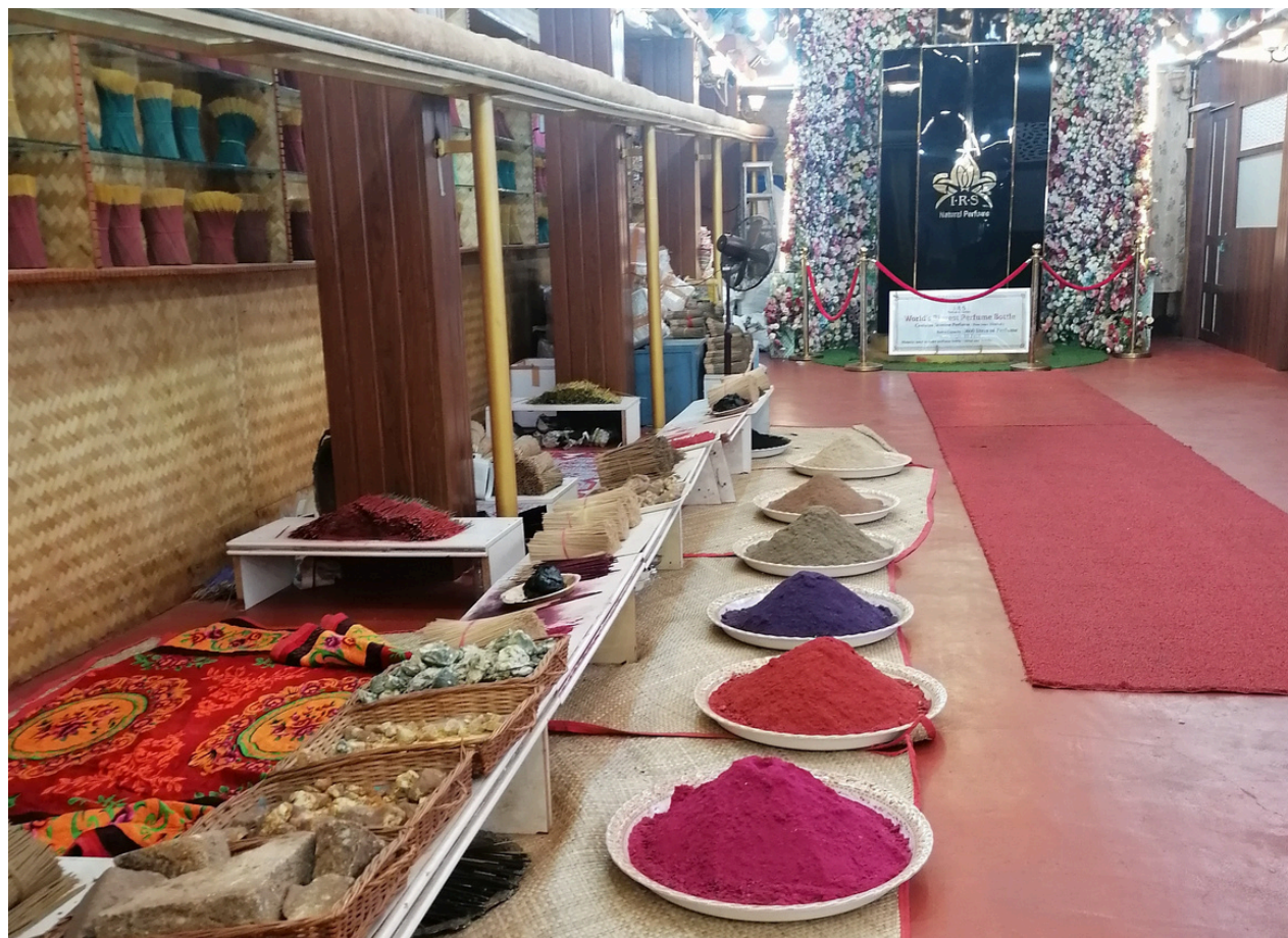
The making of natural incense in Kochi