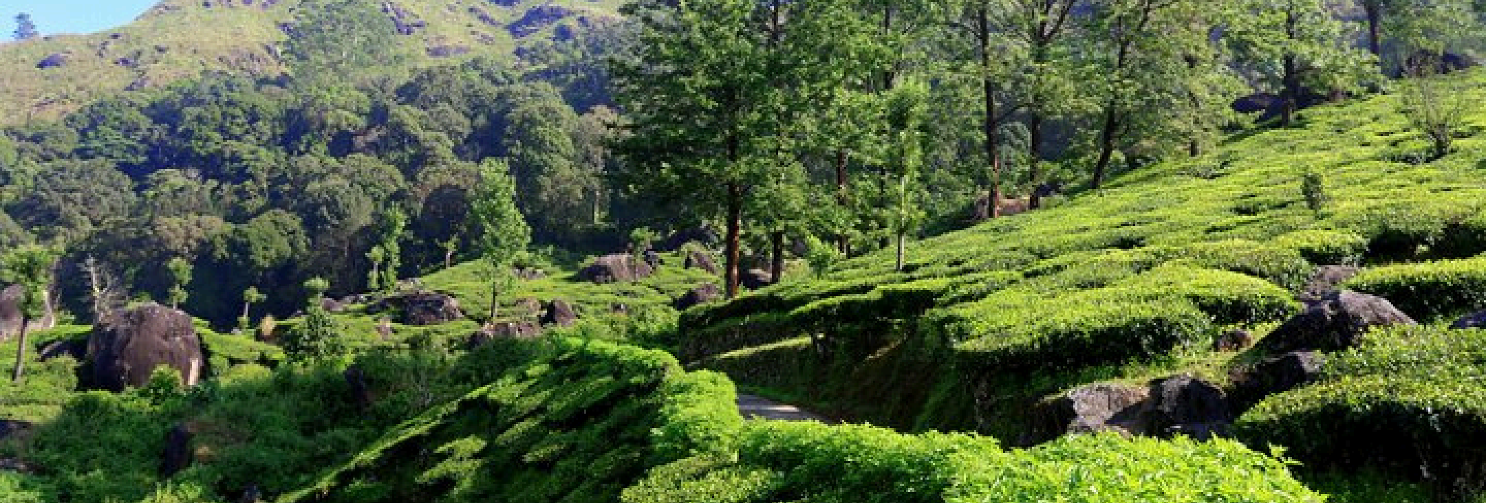
Tea plantations in Munnar